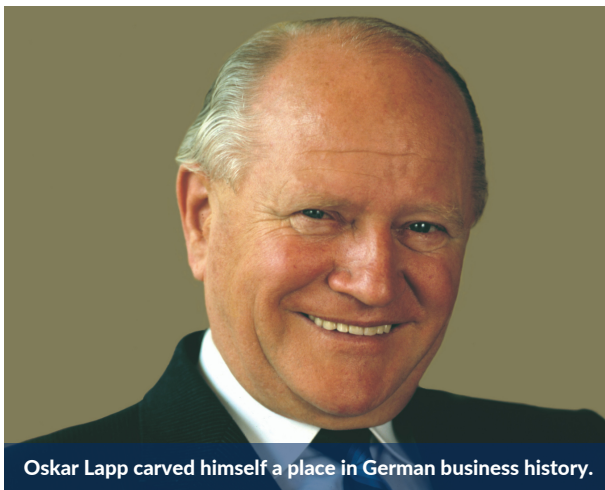
Oskar Lapp carved himself a place in German business history.

With ÖLFLEX®, Oskar Lapp set quality standards that are still applicable all over the world in cable production today. He was even offering ready made cable harnesses with up to 130 coloured cores. Demand was huge. LAPP was also one of the first suppliers to offer and cut the cable harness length to customer requirements. ÖLFLEX® was the right product at the right time and sales grew rapidly.